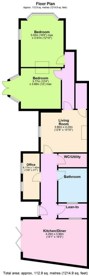
Total area: approx. 112.9 sq. metres (1214.9 sq. feet)